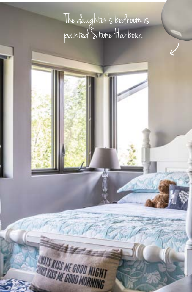
The daughter's bedroom is painted Stone Harbour.

The second level houses three bedrooms, each with its own bath. The master bedroom is a unique loft above the main living space, with a glass-railing balcony, offering the same mountain view as below, and can be closed off with sliding doors. The master en suite offers a view of Georgian Bay. Continued on page 58