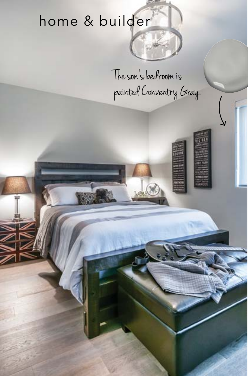
The son's bedroom is painted Conventry Gray.

LEFT: A clear, glass fixture lights the owners' son's room. BOTTOM LEFT: In the son's en suite, small black and grey tiles are inlaid to accent the marble floor and offer contrast in the upper third of the shower's subway tile. BOTTOM RIGHT: A more traditional bed is set with summery bedding in the daughter's room.