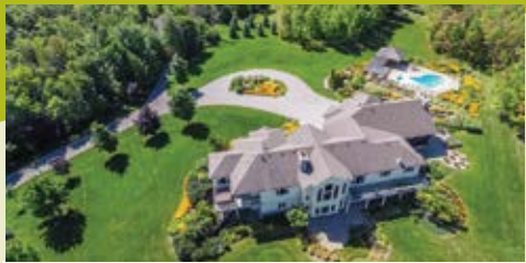
1428 NOTTAWASAGA CON. N. 5 bdrm., 4.5 bath, 6600 sq. ft. fin. $2,675,000