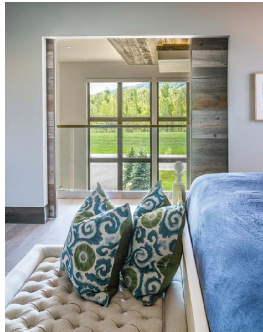
The master bedroom is painted Sea Haze and the en suite is Stonington Gray.