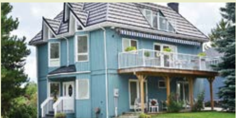
109 CARMICHAEL CRES. 7 bdrms., 5 bath, 3750 sq.ft.fin. $925,000