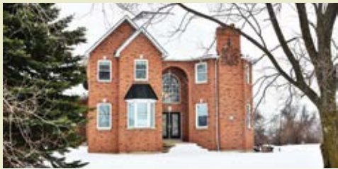
7975 POPLAR S.R. 7+1 bdrm., 3.5 bath, 5159 sq.ft.fin. $1,690,000