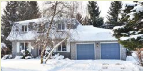
65 DUNCAN ST. 4+1 bdrm., 4 bath, 3142 sq.ft.fin. $499,000