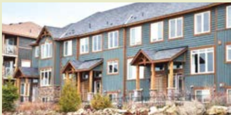
46 JOSEPH TRAIL 3 bdrm., 2.5 bath, 1733 sq.ft. $350,000