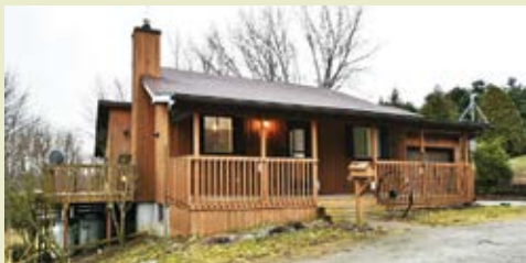
115 HARBOUR BEACH DR. 2+1 bdrm., 2 bath, 1534 sq.ft.fin., $275,000