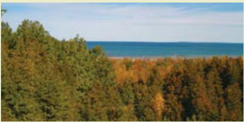
131 BARTON BLVD. 96'x175', VIEW LOT. $399,000