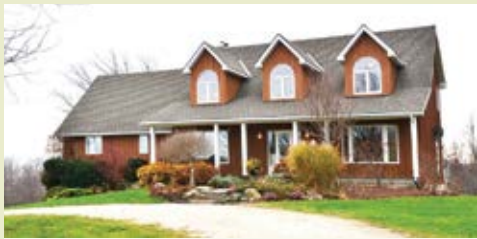
1977 124 COUNTY RD. 4 bdrm., 3 bath, 3745 sq.ft.fin. $850,000