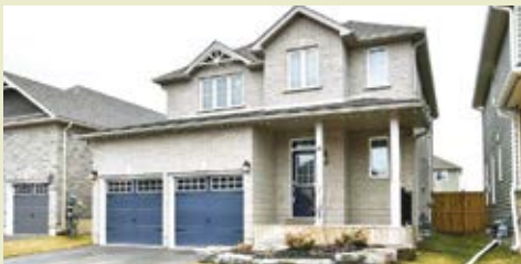
14 DANCE ST. 4 bdrm., 2.5 bath, 1945 sq.ft. $439,000