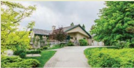
1651 124 COUNTY RD. 2+3 bdrms, 5 bath, 4310 sq.ft.fin. $1,690,000