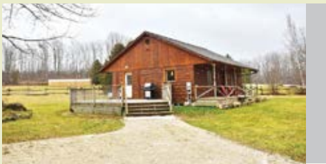
555903 6TH LINE 2 bdrm., 1 bath, 1006 sq.ft.fin. $390,000