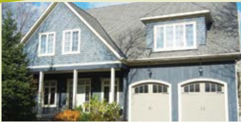
119 SALZBURG PLACE 5 bdrm., 3.5 bath, 3824 sq.ft. + $1,600,000