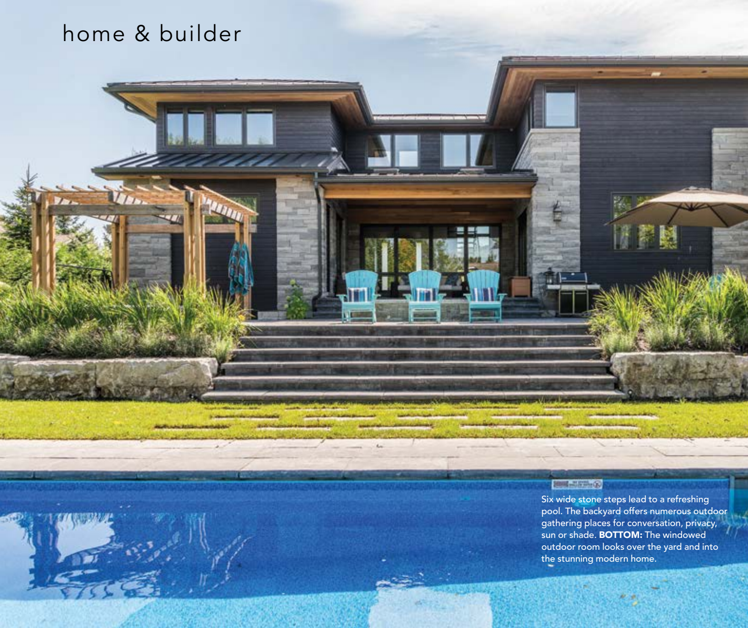
Six wide stone steps lead to a refreshing pool. The backyard offers numerous outdoor gathering places for conversation, privacy, sun or shade. BOTTOM: The windowed outdoor room looks over the yard and into the stunning modern home.